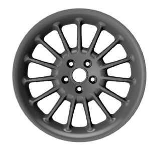
19" Plus Six Alloy Wheels - Frozen Grey