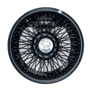
15" Black Painted Wire Wheels