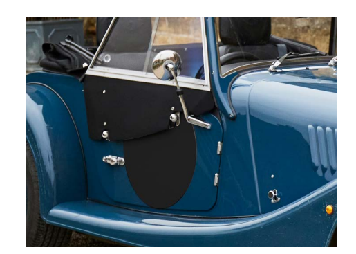
Decal Kit 2 - Door Roundel Gloss, Black