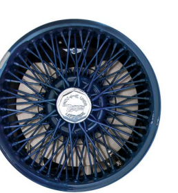
15" Dark Blue Painted Wire Wheels