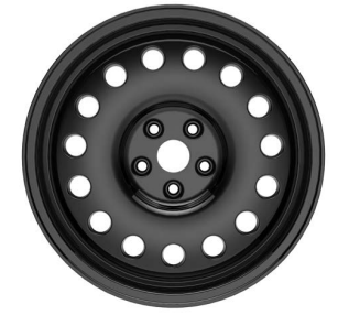
18" Speedster Alloy Wheels - Black