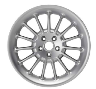
19" Plus Six Alloy Wheels - Silver