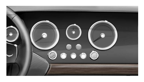
Dashboard - Matte Black Painted