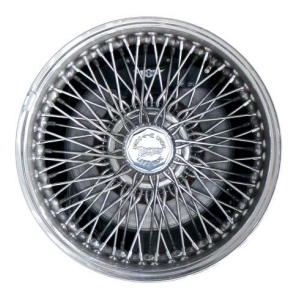
16" Polished Wire Wheels