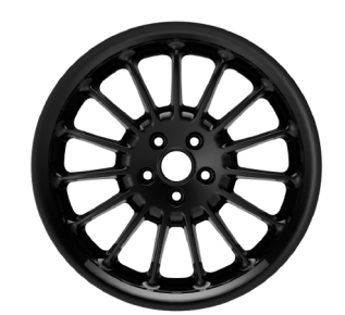
19" Plus Six Alloy Wheels - Black