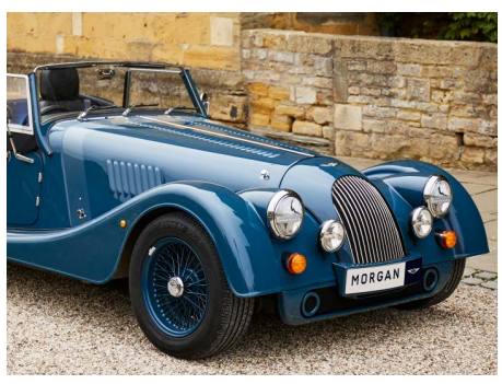
Decal Kit 10 - Bonnet Matte Clear