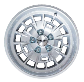
15" Silver Alloy Wheels