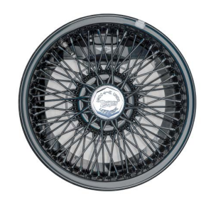
15" Dark Grey Painted Wire Wheels