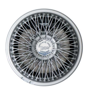
15" Silver Painted Wire Wheels