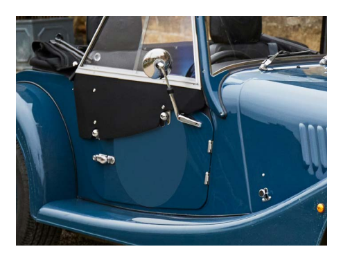
Decal Kit 3 - Door Roundel Matte, Clear