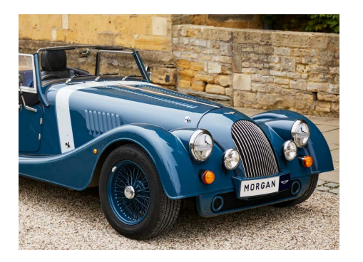
Decal Kit 8 - Bonnet Gloss Off White