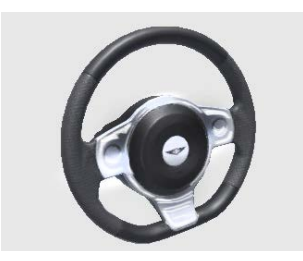
Steering Wheel Centre - Silver