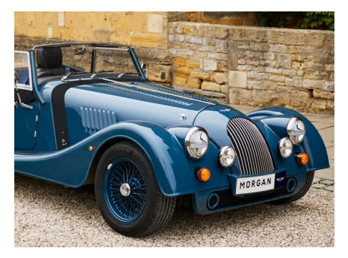
Decal Kit 9 - Bonnet Matte Black