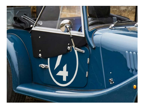
Decal Kit 4 - Door Roundel Gloss Off White with Number 0-9