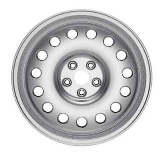
18" Speedster Alloy Wheels - Silver